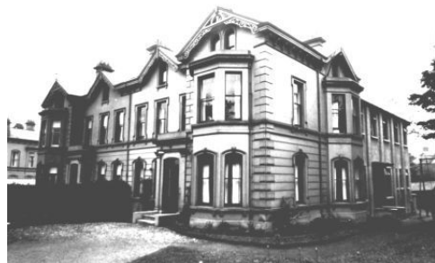
Barnardo's Home, Hollywood Road Belfast c. 1935

If there is a big town near you, that you think would be a good place for a meeting, let us know. If we get enough interest in an area we can look into arranging a local meeting.